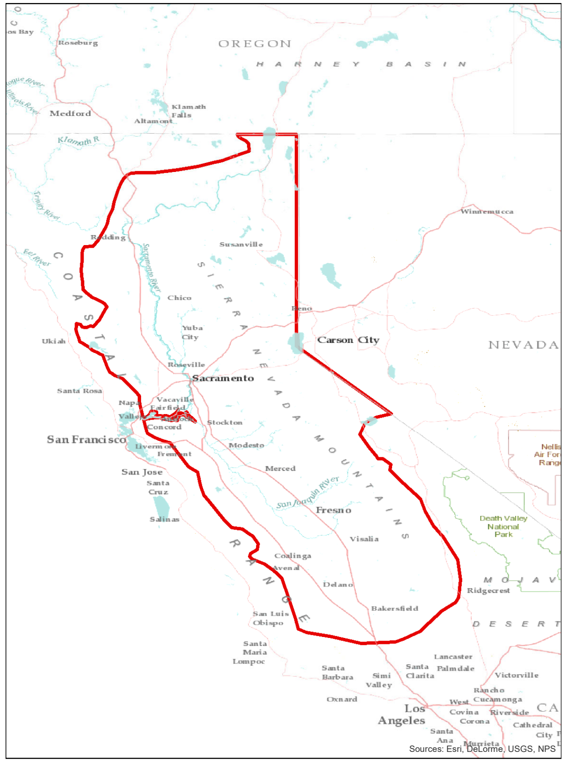
Figure 1: The Sacramento District Civil Works geographical boundary in the State of California.